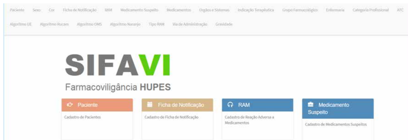
Figure 4. "Ficha de Notificação" page screen.